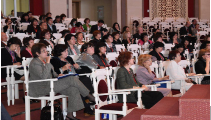
International conference "Perspectives and Challenges for HEIs and QA Agencies in the Framework of Yerevan Communique of Ministers of Education of the Countries - Members of Bologna Process", September 2015

During these seminars, IQAA informs experts in details about their duties in the team, introduces them to the standards and criteria for internal quality assurance and standards for external assessment, template of the external assessment report, and training materials. To participate in seminars and conferences, various groups of experts are involved, including students and representatives of employers.